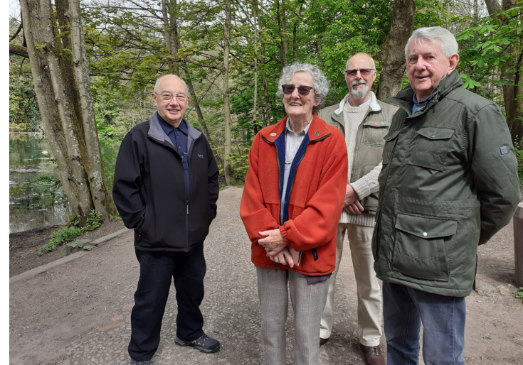
(Top and bottom image) Walks in Himley