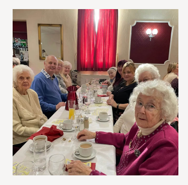
January meal at The Lodge