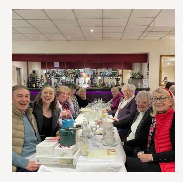
NCS -Students fundraising for us